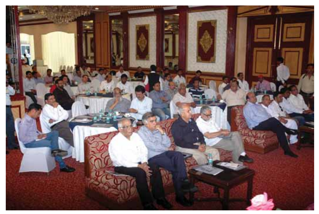
A glimpse of the participating member exporters at the interactive session

The other issues raised during the discussion included, drawback claims at ICD Moradabad, pending since January 2013; classification of handicrafts-which includes representatives from custom department going to factory for stuffing the containers and getting samples to be sent to the Development Commissioner (Handicrafts) for classification; thefts and pilferage at ICD Moradabad and the need to install CCTV cameras at ICD premises as pilferage of export goods and repacking in original form after pilferage is a serious matter and damages the goods as well as reputation of the exporters of our country; need for construction of meeting rooms at ICD, Moradabad; non-availability of trollas at ICD, for carrying containers to factory site for factory stuffing, despite ICD having trollas in their possession; and container stuffing problems at ICD Moradabad where the padlock system has fully stopped so all the stocks are stuffed at ICD. The ICD staffs are not taking due care to stuff the goods, leading to damage of the cartons as well as the goods.