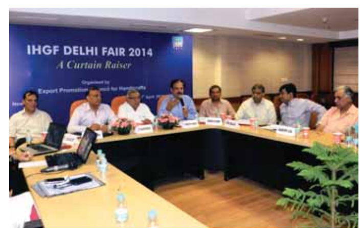
A glimpse of the programme held at New Delhi and Kolkata

A similar Curtain Raiser was held at Kolkata on 9th April, 2014 wherein member exporters from the Eastern