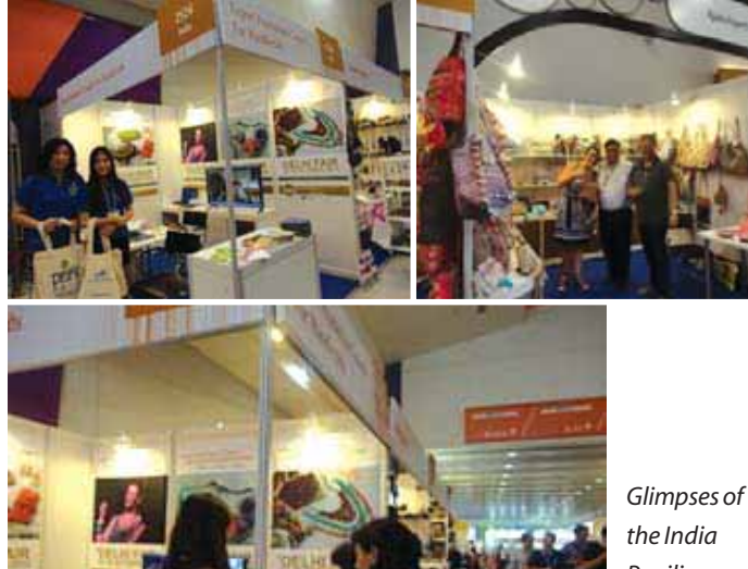
Glimpses o the India Pavilion and EPCH publicity booth

Asia's Fashion Jewellery & Accessories Show (AFJAS) is recognized as the leading event in the fashion jewellery & accessories industry and an ideal platform for volume business to be done in preparation for the seasons ahead. It is a mid-year fair, the only International event contributed to fashion jewellery & accessories industry in Asia. This edition was visited by buyers from 157 countries. Exhibitors numbers were at 3695 from 49 countries and regions, with 22 group pavilions.