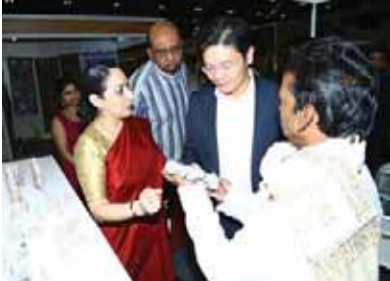
Mr. Lawrence Wong, Minister for Culture, Community and Youth and Second Minister for Ministry of Communication and information, Singapore and Ms. Vijay Thakur Singh, High Commissioner, High Commission of India at Singapore, inaugurate the Festival and meet the participants

The 3rd edition of Singapore International Indian Shopping Festival was organized by Tabla & Tamil Murasu