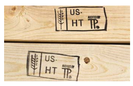
The IPPC seal

International Standards For Phytosanitary Measures No. 15 (ISPM 15) is an International Phytosanitary Measure developed by the International Plant Protection Convention (IPPC) that directly addresses the need to treat wood materials of a thickness greater than 6mm, used to ship products between countries. Its main purpose is to prevent the international