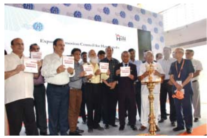
Launching the Home Expo India 2016 Directory

The organizers feel encouraged with the buyers who have optimally used this platform to cater to their sourcing needs. As the fair strived to make a mark among similar home special trade events, it certainly made an impact on the minds of buyers as well as exhibitors. While buyers were taking keen notice of the show's objectives and appreciating this substantial & composite 'home total' platform with neat and elaborate displays in manufacturers' own showrooms this time, exhibitors were wooing them with concentrated theme based product offerings. Regular buyers were doing their share of sourcing and order placing as others kept busy with new introductions vis-à-vis consolidation of old ties.