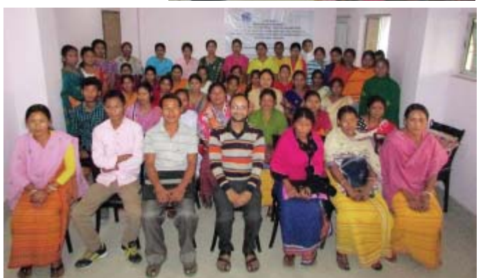
A commemmorative photograph of the participants and faculty