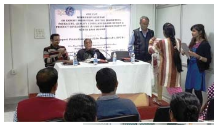
Dignitaries sharing their experiences with participants

niche market. The audience was also made aware of expoi