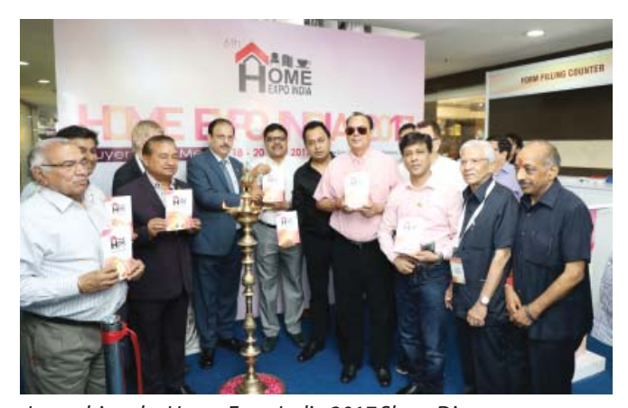
Launching the Home Expo India 2017 Show Directory

The initiative of organising this event is commendable. This expo showcases our products across a wide range of handicraft segments to potential buyers. With participation of exporters, artisans and crafts persons this fair combines three major handicraft segments.