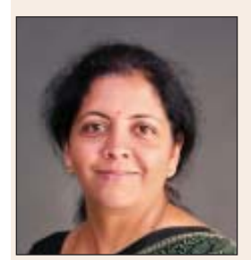
Nirmala Sitharaman Minister of State (IC), Commerce & Industry

The initiative of organising this event is commendable. This expo showcases our products across a wide range of handicraft segments to potential buyers. With participation of exporters, artisans and crafts persons this fair combines three major handicraft segments.