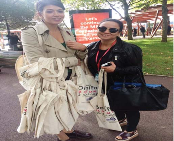
Publicity &promotions towards IHGF Delhi Fair-Autumn in full swing at Maison & Objet, Paris

serious business enquires were about 55. Overall, 2811 exhibitors with 45% from around the world and 55% from France participated. 29 Indian companies too were among exhibitors.