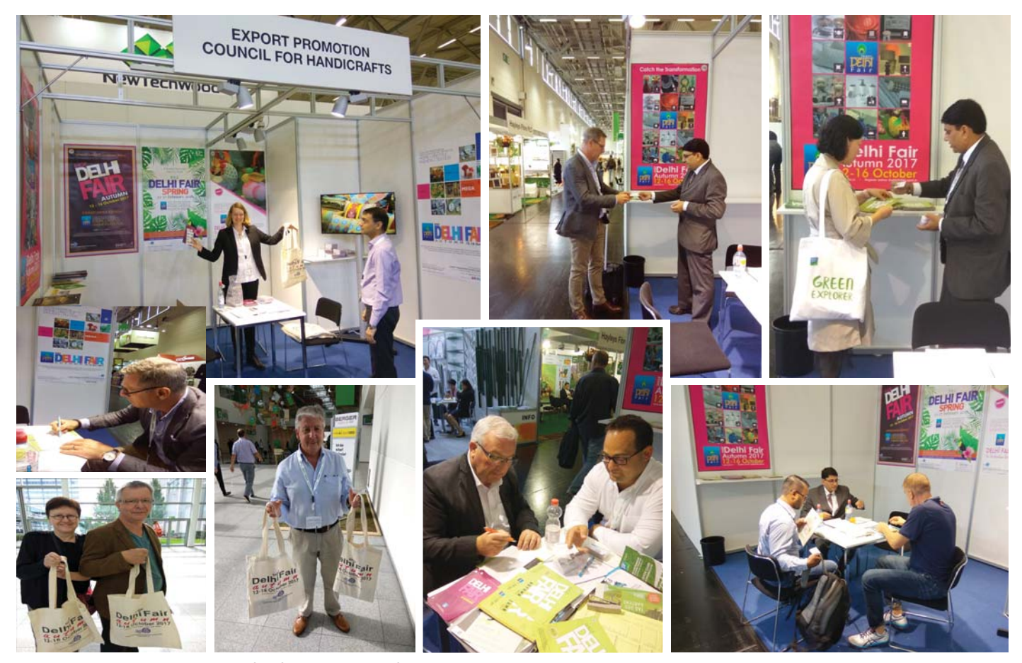
EPCH promotional booth at the fair for promotion of IHGF Delhi Fair-Autumn 2017; The EPCH representative seen interacting with the visitors

Spoga+Gafa, Cologne, Germany; 3rd-5th September 2017