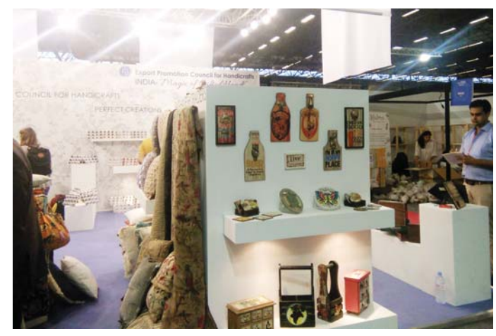
The Theme Pavilion-Magic of Gifted Hands, set up by EPCH at Maison & Objet, Paris

The success of the show can be evaluated with the visit of thousands of visitors with 65% from across the world and 35% from France. Spot orders booked by participants are estimated worth Euro 55,500.00 and