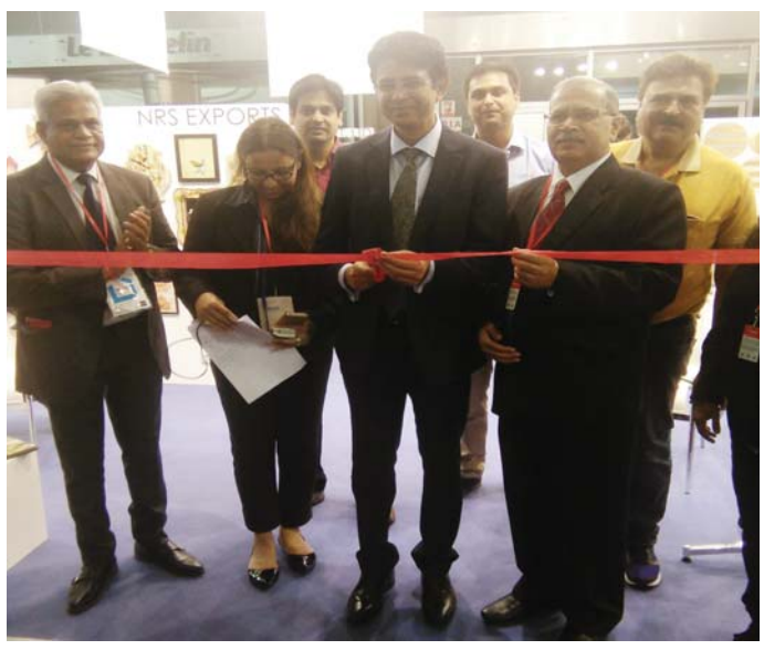
The thematic EPCH India Pavilion was inaugurated by Mr. Manish Prabhat, Deputy Chief of Mission, Embassy of India in Paris, after which he interacted with the participants

The vibrant display depicting richness of Indian home & lifestyle products aimed at a brand image projection of Indian handicrafts, comprised premium products in home décor, home textiles, tableware and home accessories like knobs. The objective was to promote India as an important sourcing destination for all kinds of