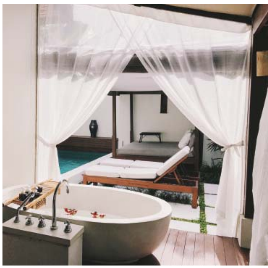
Hospitality Attires & Accessories The IHE Lifestyle Show