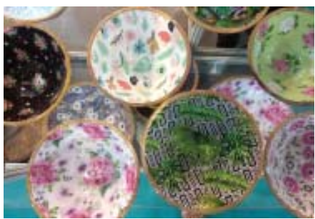
"The show is fantastic. There has been a moderate buyer response this time tobut they are all genuine enquiries." Sanjeev Agarwal