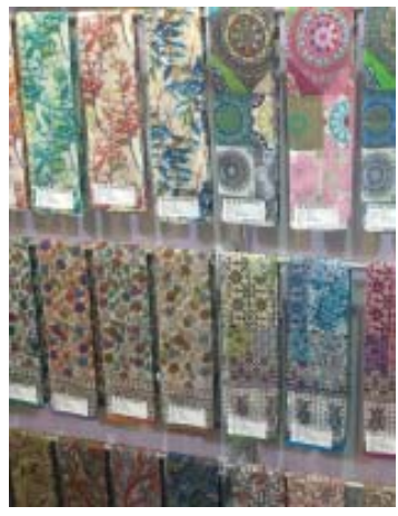
"I participate in both IHGF fairs every year. The platform that EPCH provides is very good and beneficial." Arpit Tandon

speciality and they bring out new designs for every season, with emphasis on European market trends. The raw materials are sourced from Bangalore and Surat. "We are