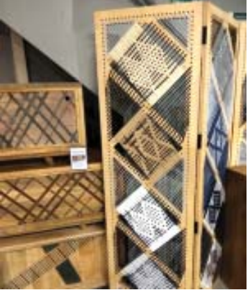
"This edition of IHGF is well organised and with the fair's approach of including a cross section of buyers, EPCH is helping many businesses to grow." Ashish Gupta

step in order to create a product that is superior and sustainable, they have a vertically integrated furniture powerhouse with 700 people, that adopts a 360-degree approach for innovation, engaging all areas of their business to inspire creativity and learning with an ultimate aim of 'conscious engineering'. They export to around 37 countries including most of Europe. Explained Mr. Gupta, "our products are a combination of hand-made as well as machine made products; the core is engineered whereas the surface is handmade. We have got a factory in Rajasthan as well as in Meerut. For our furniture, we use textiles, metal, stone, leather and various other kinds of raw material."