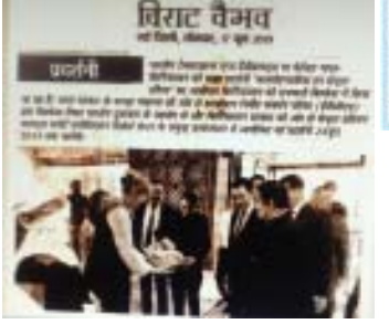
Coverage of the show by print media