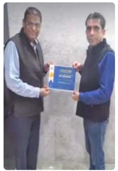
Award Category Decorative & Gift (Including Corporate Gifts)

Awards were also given in categories of Women Entrepreneurs; Associate Organisations; and Regions - Central, Northern, Southern, Western, North Eastern and Eastern Region.