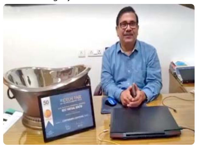
M/s. Coppersmith Creations, New Delhi