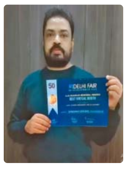
Award Category Lawn, Garden Ornaments and Accessories