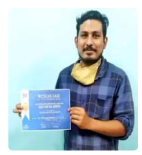
Award Category North Eastern Region

M/s Kausummbh Enterprises, Bangalore, Karnataka