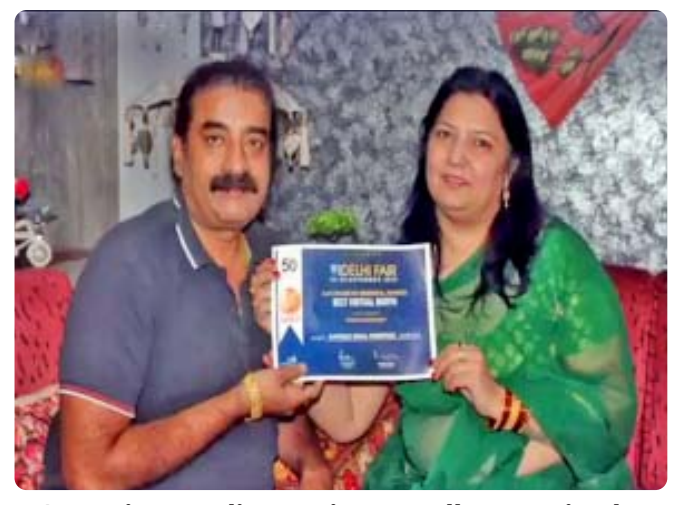
M/s. Antique India Furniture, Jodhpur, Rajasthan